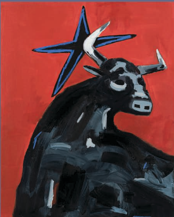
Artwork by Caitlin: “Lonely Star”, Oil & Mixed Media on Canvas, 60 x 70cm, 2023